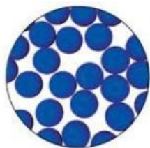
Particles in a liquid

In liquids the particles are held together by attraction, but the bonds between them are weaker than those in solids. The particle attraction allows the particles to roll over each other, but they can't 'escape'. Liquids have a fixed volume, but the rolling motion of the particles allows them to take the shape of their container. As in solids, the particles are still very close together, so liquids cannot be compressed into smaller spaces.